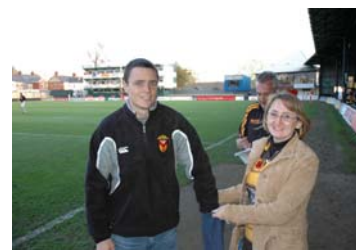
WKN performs the draw